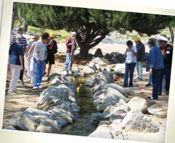
Racing ducks sort of moseyed on down the community’s new stream at an agreeably leisurely pace.