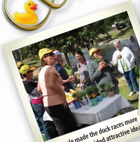
A plant sale made the duck races more enjoyable and provided attractive ideas.