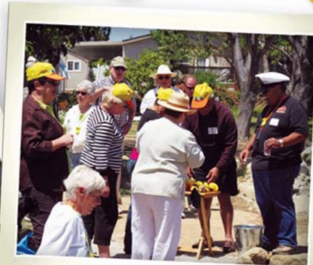
Residents check in with their respective ducks before the big race.