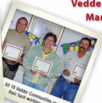
All 18 Vedder Communities recognized their hard-working staff on March 9.